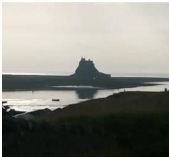
Image : Lindisfarne Castle, Holy Island

A humble man, Aidan managed to bring the best out of almost everyone.