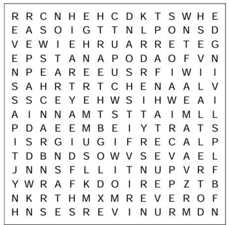
Bible Word Search, Vol. VI: Parables in the Bible

Copyright 2008 © GIL PUBLICATIONS, www.BibleWordSearchPuzzles.com