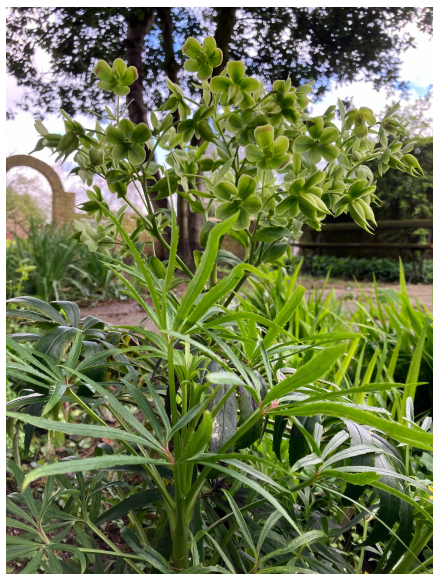
Stinking hellebore: one of the plants that will be staying

The original garden had noticeable geometric features and some of these will be reintroduced. The vegetables, currently grown together in one bed, will hopefully be dispersed so they are grown annually with other plants linked by specific cures. There will inevitably be an element of compromise once the final plans are drawn up as our master plan will need to incorporate aspect, size and aesthetics but we are looking forward to the challenge and are confident that the end result will be both faithful to the original concept and planners while bringing new ideas and vigour to the space.